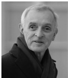
JEAN JOUZEL CLIMATE CHANGE

Attorney, economist, professor (Bard Business School), consultant (Council Fire) and author (The Main Street Journal), specializing in the development of local economies